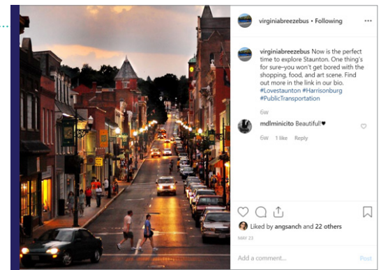
(The Instagram image above is from Staunton Tourism Agency.)